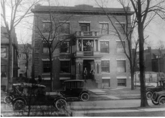
A converted apartment house served as a crowded Holy Angels dormitory on Alexandrine Avenue in midtown Detroit, early 1920s.