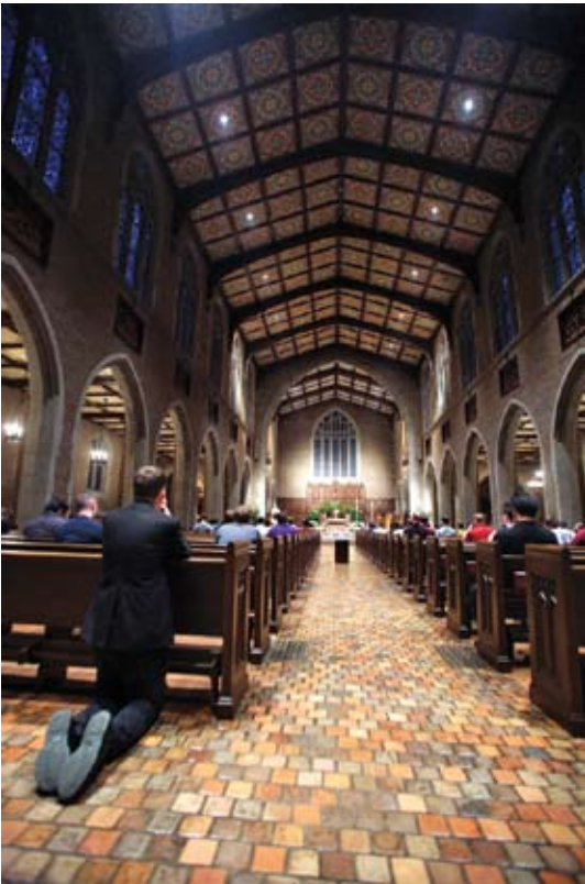
The main chapel features stunning made-in-Detroit Pewabic tiling. The entire chapel underwent extensive cleaning and restoration work in 2009 after a ceiling fire.