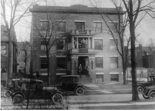
A converted apartment house served as a crowded Holy Angels dormitory on Alexandrine Avenue in midtown Detroit, early 1920s.