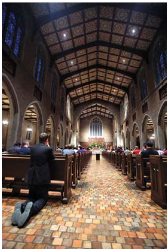
The main chapel features stunning made-in-Detroit Pewabic tiling. The entire chapel underwent extensive cleaning and restoration work in 2009 after a ceiling fire.