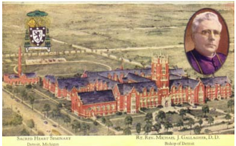
This postcard supported Bishop Gallagher’s campaign to raise funds for a new seminary. It features an architectural drawing depicting the future Gothic Revival seminary complex.

In 1958, the high school was separated from the college seminary. To accommodate this change, the Cardinal Mooney Latin School was built on the seminary grounds while classrooms at the seminary were converted to student rooms to accommodate the increasing college enrollment.