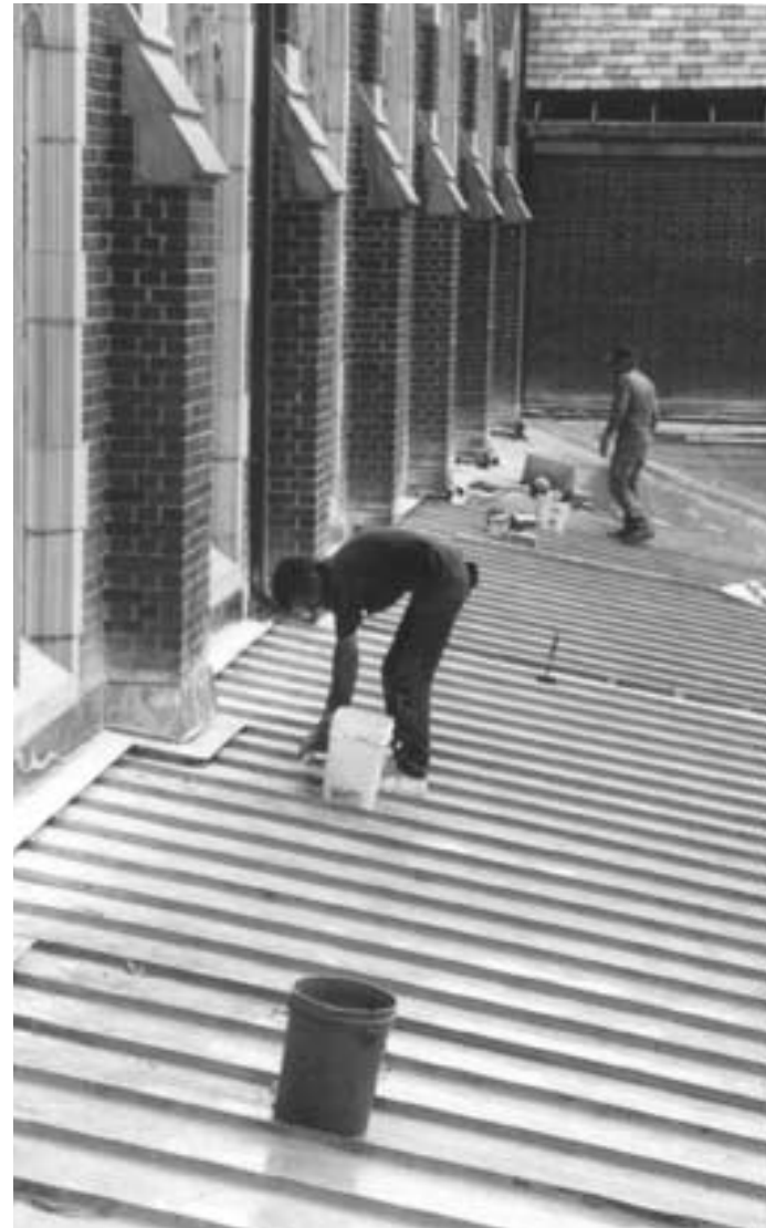
Workers secure copper roofing panels that will match the look and quality of the original roof installed in 1919.

Know that your response to Sacred Heart’s annual appeal goes a long way