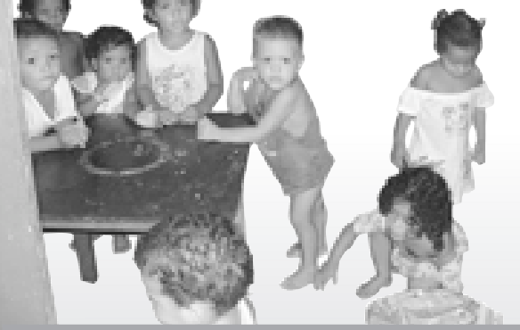
Day care center in Nova Descoberta.