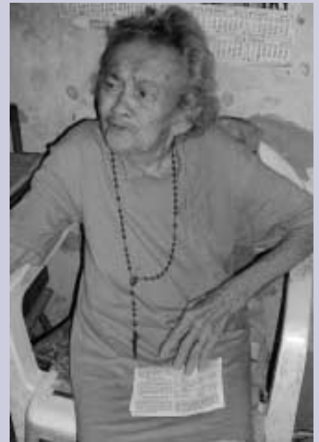
Though poverty abounds, so does deep faith, witnessed by this homebound woman with her rosary.

painfully small houses set precariously on those mountains. I saw dirty shops and markets, garbage piled in the streets and children without shoes.