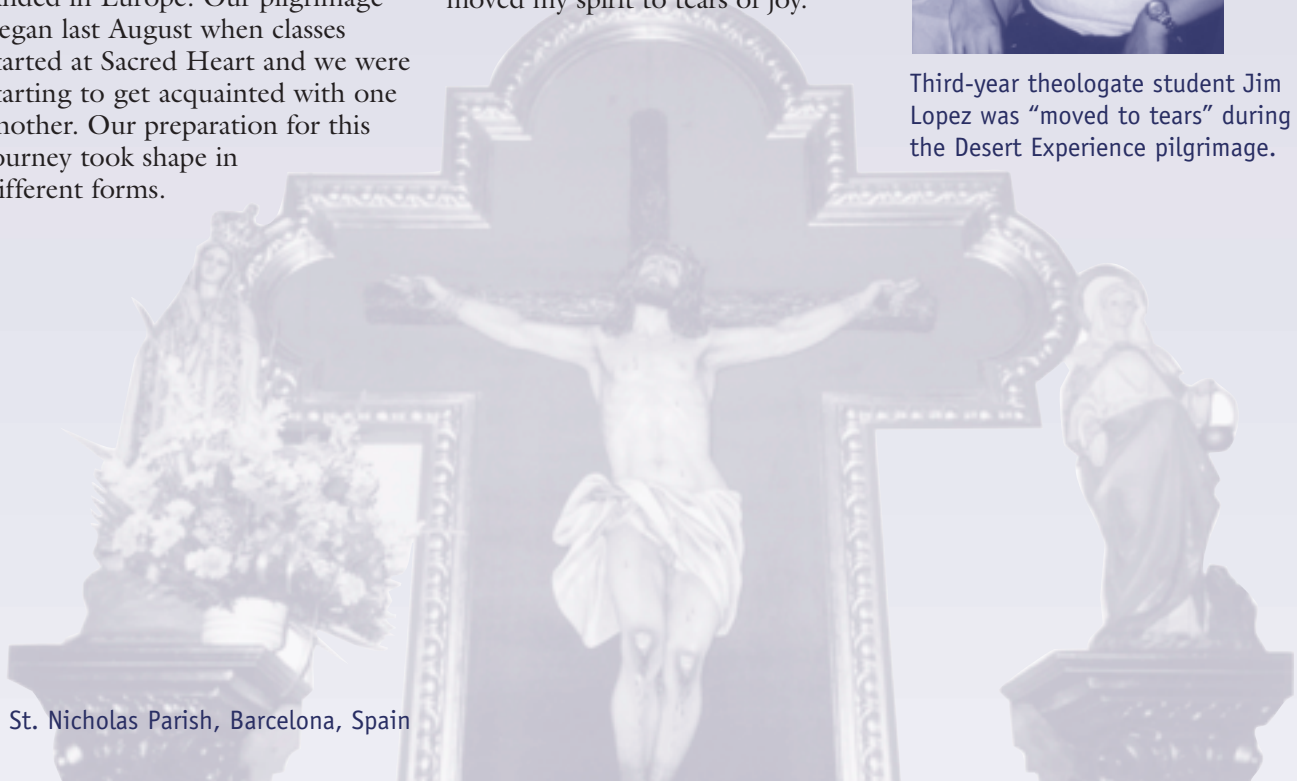
St. Nicholas Parish, Barcelona, Spain